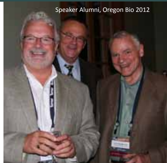
Speaker Alumni, Oregon Bio 2012

The association's 2010 Economic Impact Study showed that Oregon has 631 bioscience establishments and 13 life science research institutions generating a cumulative $7.1 billion in economic activity, 36,800 jobs, $1.9 billion in personal income and $273.9 million in local and state tax revenues.